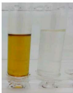
0 h @ 190 °C

Left: Standard polyamide adhesive | Right: Jowat-Toptherm® 845.10