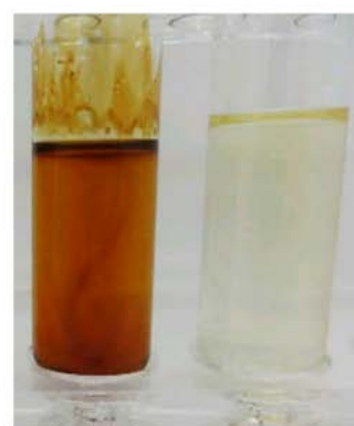
24 h @ 190 °C

The information given in this leaflet is based on test results from our laboratories as well as on experience gained in the field, and does in no way constitute any guarantee of properties. Due to the wide range of different applications, substrates, and processing methods beyond our control, no liability may be derived from these indications nor from the information provided by our free technical advisory service. Before processing, please request the corresponding data sheet and observe the information in it! Customer trials under everyday conditions, testing for suitability at normal processing conditions, and appropriate fit-for-purpose testing are absolutely necessary. For the specifications as well as further information, please refer to the latest technical data sheets.