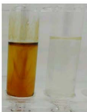
8 h @ 190 °C