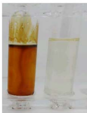
16 h @ 190 °C