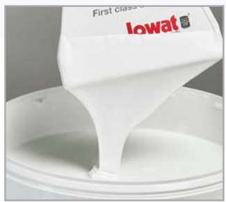
The information given in this leaflet is based on test results from our laboratories as well as on experience gained in the field, and does in no way constitute any guarantee of properties. Due to the wide range of different applications, substrates, and processing methods beyond our control, no liability may be derived from these indications nor from the information provided by our free technical advisory service. Before processing, please request the corresponding data sheet and observe the information in it! Customer trials under everyday conditions, testing for suitability at normal processing conditions, and appropriate fit-for-purpose testing are absolutely necessary. For the specifications as well as further information, please refer to the latest technical data sheets.