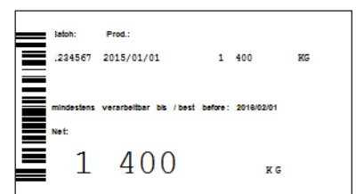
Label with best-before date printed on it

For questions and further details, please contact your Jowat sales representative.