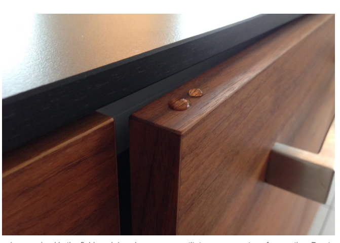
The information given in this leaflet is based on test results from our laboratories as well as on experience gained in the field, and does in no way constitute any guarantee of properties. Due to the wide range of different applications, substrates, and processing methods beyond our control, no liability may be derived from these indications nor from the information provided by our free technical advisory service. Before processing, please request the corresponding data sheet and observe the information in it! Customer trials under everyday conditions, testing for suitability at normal processing conditions, and appropriate fit-for-purpose testing are absolutely necessary. For the specifications as well as further information, please refer to the latest technical data